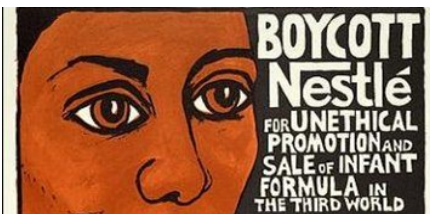
Boycott Nestle products, 1977.