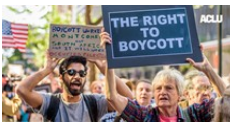
Students protesting for the right to boycott. ACLU