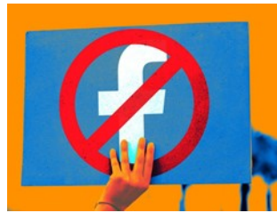
Boycott of Facebook, AdAge.com