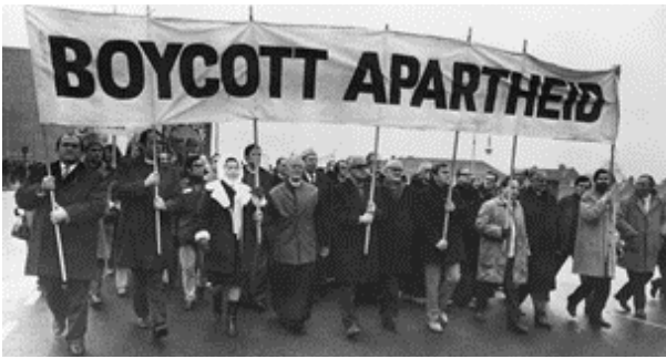
Boycotting South African Apartheid