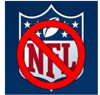
Boycott call in response to "taking a knee," Twitter