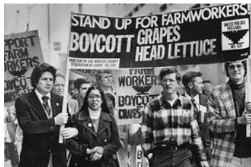
United Farm Workers boycott, 1965-1970