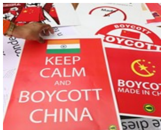
Boycott China, 2020.

For more information, contact mnforhumanrights@protonmail.com