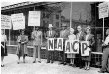
Safeway refused to hire African Americans, Washington Area Spark , 1941

The Minnesota Legislature will soon hear HF1246 and SF1039, to repeal two MN Statutes—3.226 and 16C.053—adopted in 2017 and known as the anti-Boycott laws. We believe you should support the repeal of these laws because: