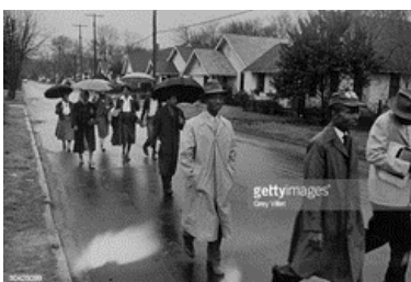
Montgomery Bus Boycott, 1955-56.